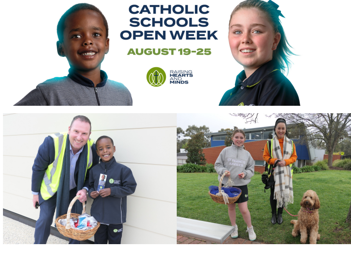
Student Representative Council

At our school we value the intrinsic worth of each child and we provide quality learning in a Catholic context. We pride ourselves on educational excellence, nurturing each student and teaching the children about values and being the best person they can be. Working in partnership with you to educate and nurture your child is what we care about and make happen every day. SFX is truly the place to be.